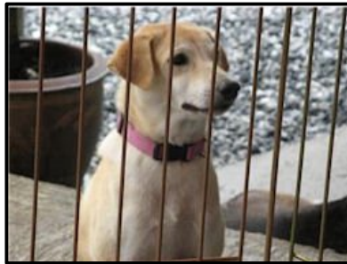
Dog at the Health Centre

Our patients are the cause of considerable damage too! Many of the animals have never been confined before and are very affronted by wire caging and steel doors. They will go to extraordinary lengths in their efforts to escape - a dog can chew through the heavy-duty steel mesh of a cage and then through the steel wire of the kennel run doors in a matter of hours if determined.