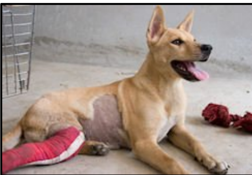
Posh with her bandage

Posh has now received the surgery she needed to save her life and although it was touch and go for a few days, is now recovering. She will convalesce at SCAD when she is well enough to be moved. Without the kindness of a passer-by who persevered and the expertise of the vets at Suwannachart Hospital who took the time to make a correct diagnosis, Posh would have died from her injuries.