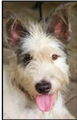
Ngao - available for adoption now

Please open your heart to a rescued animal and give an ex-soi dog a loving home. Ngao (pronounced 'now' and meaning shadow) was found abandoned on the edge of a busy highway, terrified and hungry. A family moving away from the area early in the New Year had callously dumped Ngao to survive alone on the streets. She is housetrained and walks well on a leash and is waiting patiently at our rehoming centre for a new chance at happiness. If you can help Ngao or others like her, please contact: