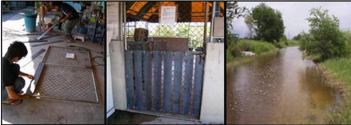
Photos from the Health Centre: Extra steel bars on the kennel run cages are attached and flooded road to the Health Centre

Our Animal Birth Control (ABC) and veterinary treatments are run from our Health Centre, situated in a rural area on the outskirts of Bangkok. There, resident vet, Dr. Komkrit, carries out on average 140 sterilisations per month and provides around 200 treatments for dogs and cats in need. We're proud of these achievements, but running the centre is a costly business and medical supplies are not the only daily expense. Behind the scenes volunteers and staff face a constant battle to keep the buildings and environment in good order. The weather also takes its toll on the facilities: wood rots; metal rusts and in the rainy season there is often flooding, making each day an adventure!