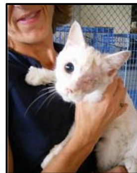
Lom after the operation

Lom was given cage rest after surgery and a great many cuddles by SCAD staff and volunteers! As time drew nearer for her release, the SCAD team fretted about her future – even in the cage Lom struggled to locate her food bowl and litter tray and it was very apparent that she would not survive on the street. Then serendipitously, the 'auntie' came to say that she had found a home for Lom - a friend had offered to care for this brave little cat for the rest of her life. SCAD was sad to see her go, but happy and grateful that she has a second chance at life.