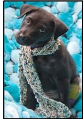
Mee -Noi available for adoption now

Love comes in all forms. It celebrates devotion, compassion, affection and respect. Our rescued soi dogs have the power to spread love far beyond the borders of Thailand, to touch us wherever we may happen to live, and affect our lives in surprising ways. These dogs are responsible for bringing strangers together. They move us with their forgiveness, affection, and indomitable spirit. These animals are the Ambassadors of Love.